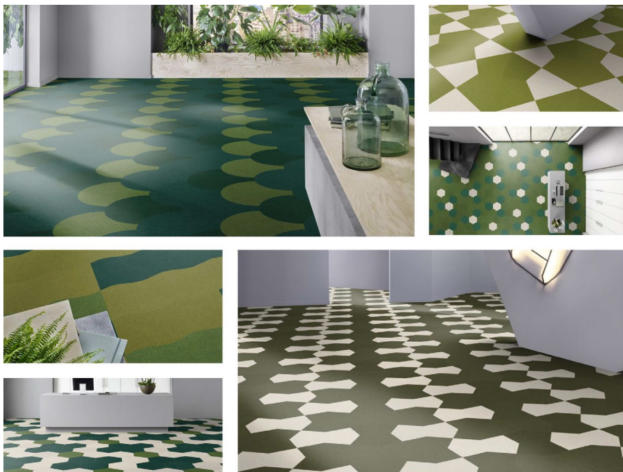
Millions of possibilities, easily visualized by the tiles configurator.

Vorwerk flooring presented its new SL SONIC (freeform) tile line-up at the start of the year – ensuring a maximum of modularity and individuality, as well as a high standard in the area of acoustics and durability never seen before. To offer its customers the cherry on top, the company has now made an online tile configurator available which makes the millions of possibilities an experience on the Web too.