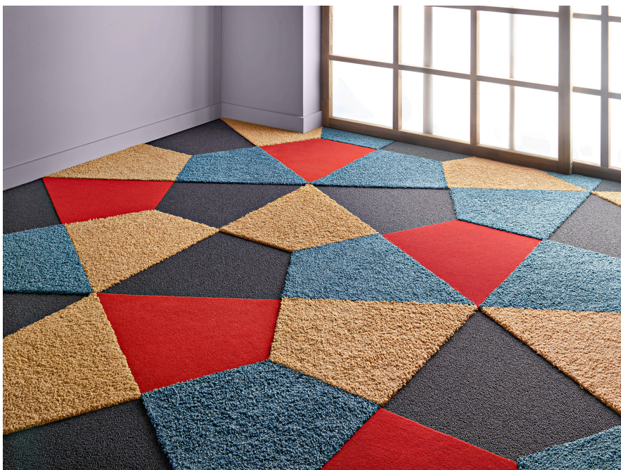
Individual floor mosaic tiles which polarise can be combined with freeforms such as CRYSTAL.

The new range of acoustic tiles from Vorwerk flooring offers the highest standard of modularity. Under the banner “When ten tile forms make millions of possibilities possible”, the company is now offering ten new SL SONIC tiles in the standard format as well as in exciting and novel freeform designs.