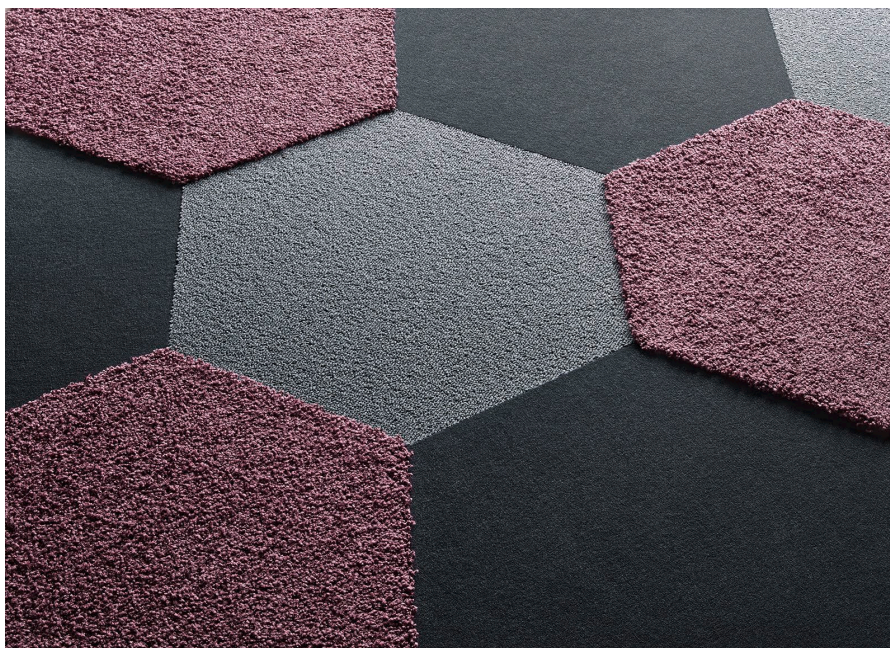
Different carpets can be combined to create exciting overall designs.

Thanks to the modular construction of SL SONIC textile tiles, it is possible to combine very different carpets with one another and thus realise completely new interior design ideas: subtle accents, purposeful zoning or textile floor mosaics with a character that is a true highlight. They offer an extra touch of uniqueness in terms of their optics, haptics and acoustics. At the same time, Vorwerk flooring naturally remains true to its principles and delivering the high-quality and sustainability characteristics of “made in Germany” that customers have come to expect. They likewise set new standards in acoustics and durability.